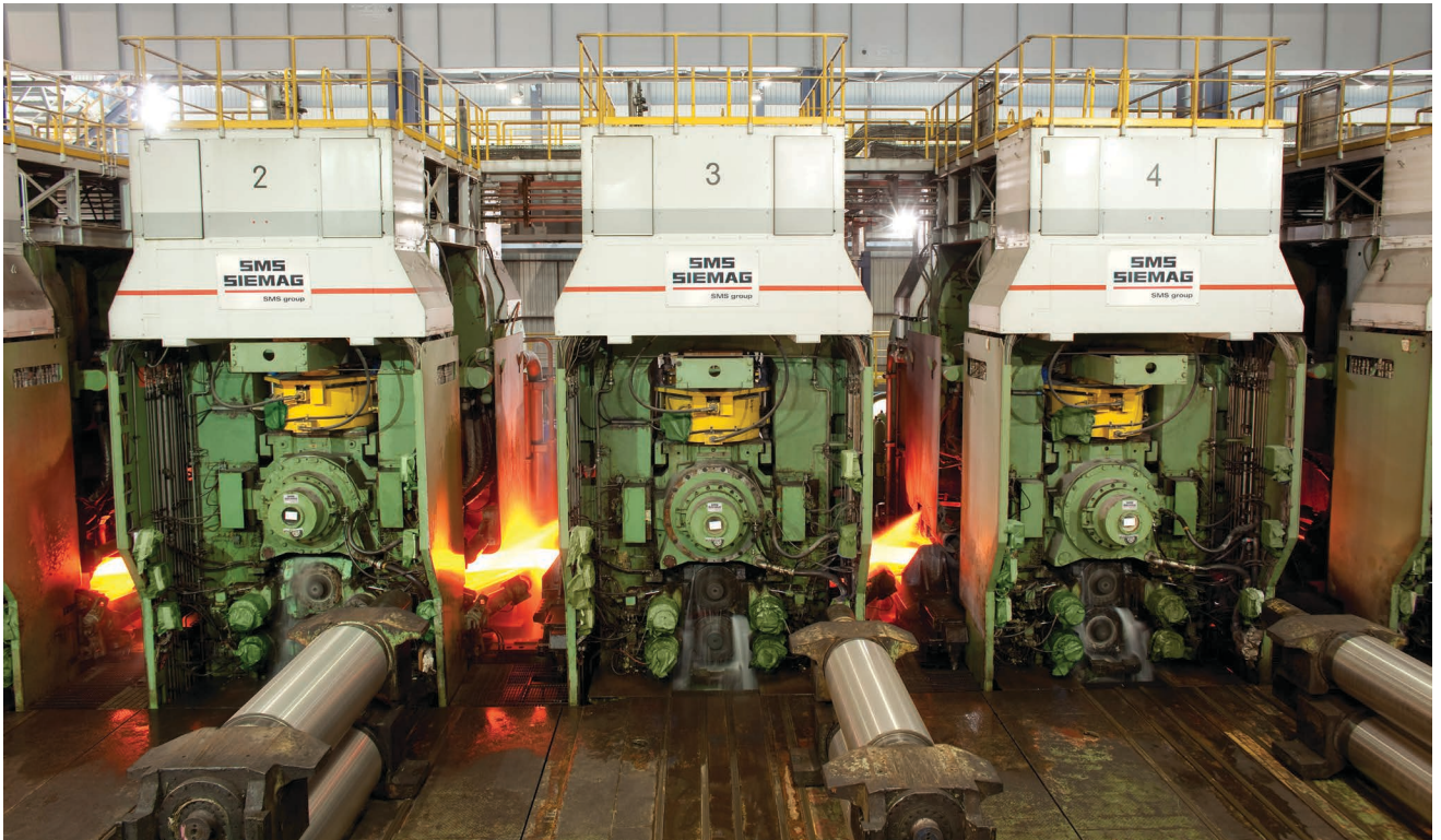
Figure 2 — A CSP® design will be supplied to Big River Steel and will feature an SMS-developed roller hearth furnace, in which the slabs produced in two casters of the CSP plant are transported via a parallel carriage to the mill stand, enabling Big River Steel to fully utilize the high rolling capacity of the 6-stand CVC® plus mill.

little longer than typical ones, which is important for niche products such as silicon steels, American Petroleum Institute (API) and high-strength low-alloy (HSLA) grades, Bula pointed out.